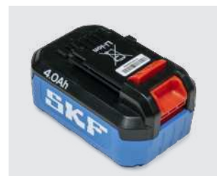
TLGB 21-9 20 V 4.0 Ah Li-ion battery