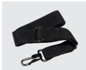
TLGB 21-1 Shoulder carrying strap