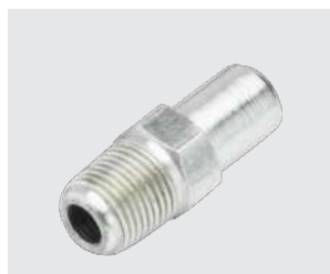
TLGB 1-1 Filler nipple for filling