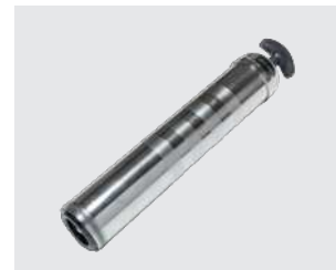
TLGB 21-4 Grease tube assembly kit