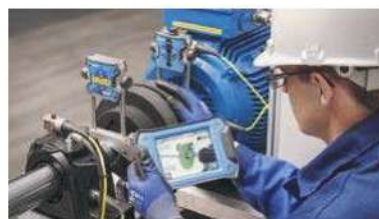
SKF Shaft alignment tools