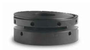
SKF Vibracon chocks