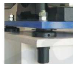
SKF Vibracon low profile chock and spherical washer

Vibracon selection tool: mapro.skf.com/vibracon